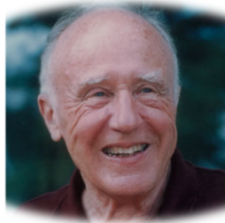
Ed Lorenz (1917-2008)